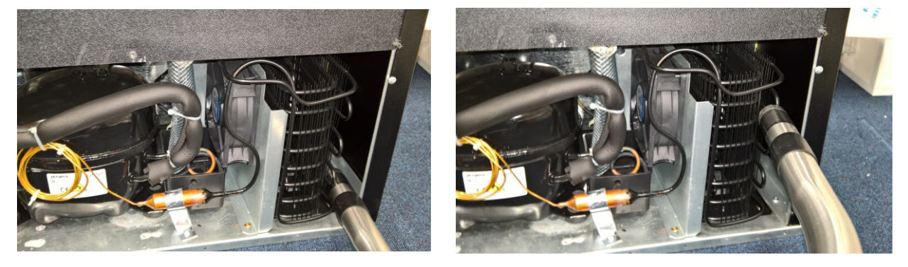
② Use vacuum nozzle to remove any debris